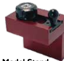
NTS Model Stand