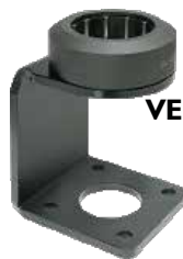
VE340 Model Stand